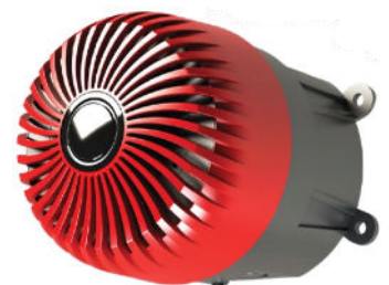
R100 with R100-SM/WP Outdoor Back box

For the benefits of installation the R100 comes equipped with a pluggable terminal connector for ease, allowing quick and simple connection during the second fix phase.