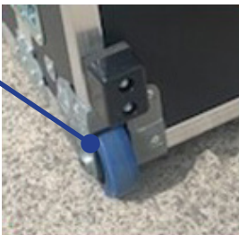
2 x Heavy Duty Wheels