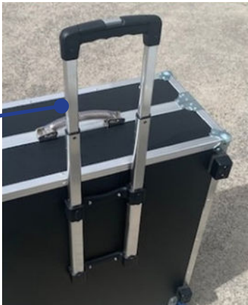
Retractable, Telescopic Handle