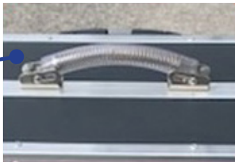
Strong Carry Handle