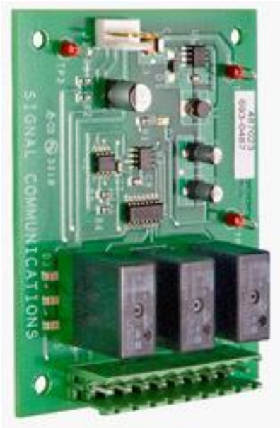
ZT-MNS-100BAS Interior Layout