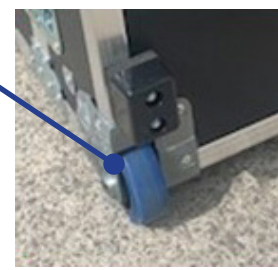
2 x Heavy Duty Wheels