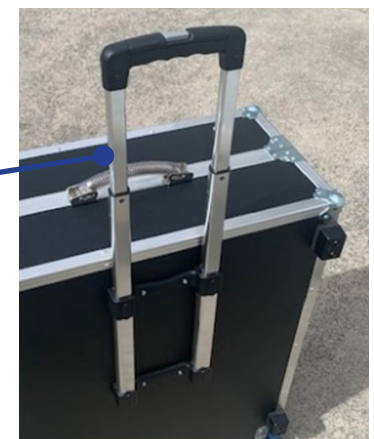
Retractable, Telescopic Handle