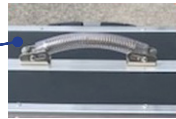
Strong Carry Handle